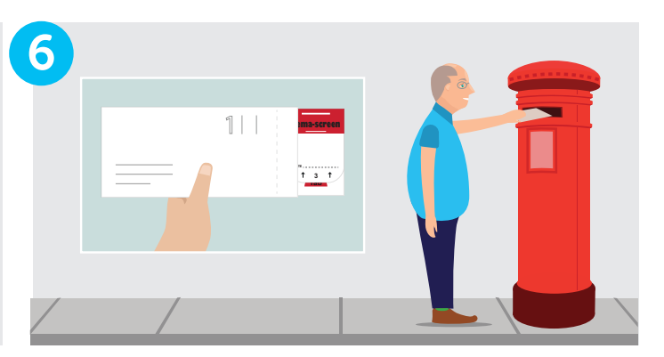
Put the kit in the prepaid envelope provided and post it back. You should get your results within 2 weeks.

Repeat the process, samples from 2 more poos on different days, within a 10 day period.